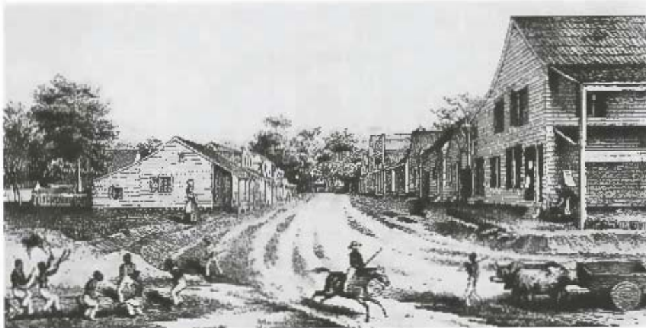
Tallahassee street scene, late 1830s

As Florida's immigrant population increased, so did pressure on the federal government to remove the Indian people from their lands. The Indian population was made up of several groups, including the Seminole and Miccosukee people. Many African American refugees lived with the Indians. Indian removal was popular with white settlers because the native people occupied lands that whites coveted and because their communities often provided sanctuary for runaway slaves from the north.